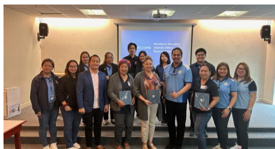
Nursing Program Staff and Faculty