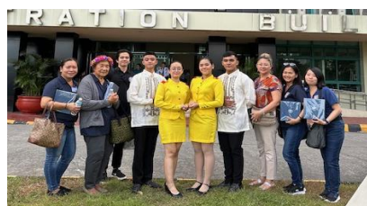
BSN Nursing (female) students