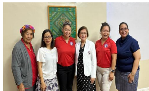
Nursing Program Director and staff