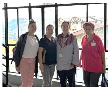
With the Dean, Nursing Program