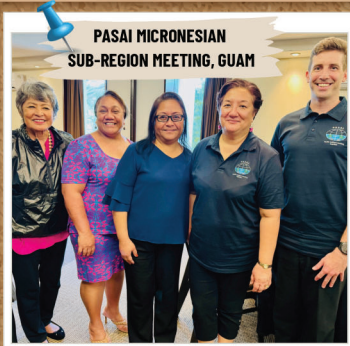
PASAI MICRONESIAN SUB-REGION MEETING, GUAM