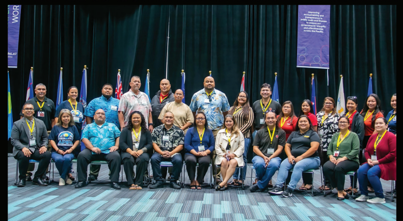
CNMI Delegation APIPA 2024 ANNUAL CONFERENCE