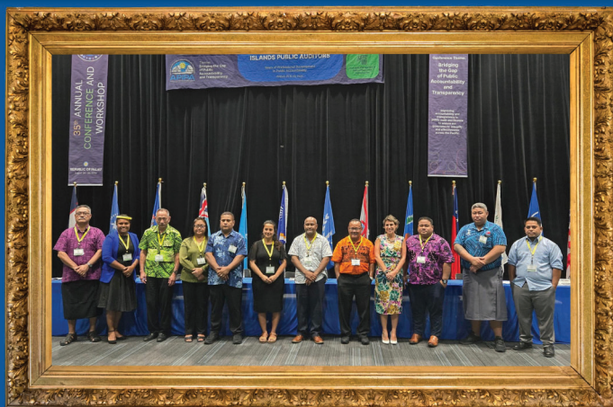
ASSOCIATION OF PACIFIC ISLANDS PUBLIC AUDITORS (APIPA)