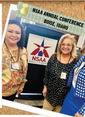
NSAA ANNUAL CONFERENCE BOISE, IDAHO