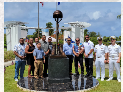
Unveiling of the Fallen Soldier Memorial Statue