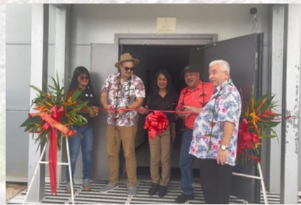
Ribbon Cutting of the Tinian Diamond Suites