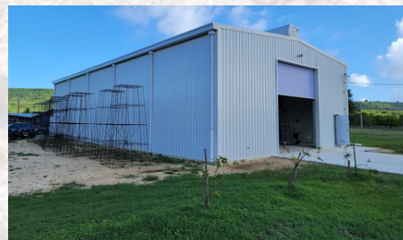
New Construction of the MOTA Warehouse