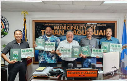
Funding from the Tinian Leadership to complete the Chamorro Herbal Medicine Book