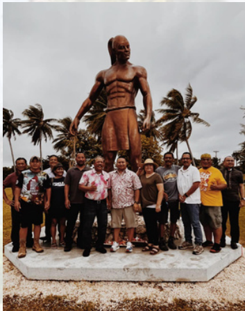
Unveiling of the Maga'lahi (Chief) Taga Statue