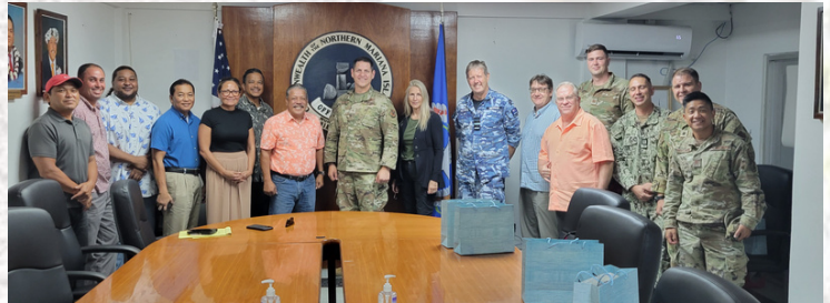
Tinian Leadership met with the Under Secretary of the United States Airforce and other high-ranking DOD Officials from Washington D.C.