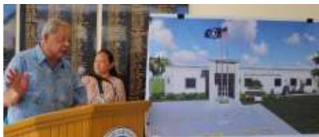
Lt. Gov. Apatang underscores importance of the Saipan legacy project of the Mun. Council.