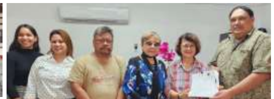
OGM Delivery of OIA Solar Grant Notification to 17 th Council Leadership