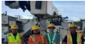
CUC Crew assisted the Council with the tree trim at the Kiosk.