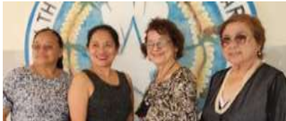
17 th Council Leadership Links with ITE