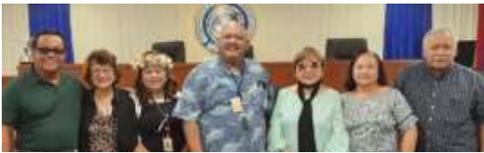
Municipal Leaders-SNILD Meet-n-Confer