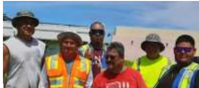
DPL Retracement Survey of Council C.K. Lot