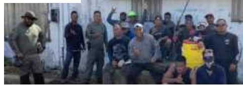
DOC Clean-up Preparation for Municipal Facility Ground breaking