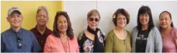
Council-DPL Summit on Gani Homestead & Open Farmers Mkt.