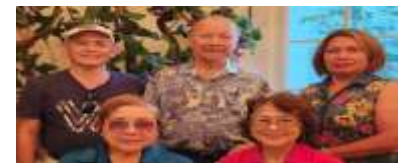
17 th Council-Lion's Club Community Garden Project Planning. Council Sec. not pictured.