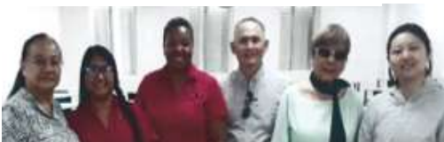
NMC CREES Briefing on USDA $10 Million NMI Agri-Tourism Grant