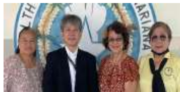
Japan Consul Meet-n-Confer on Japan's Treated Radioactive Water