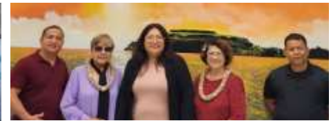
Rota Mayor and Council with 17 th Council Leadership on PAMC