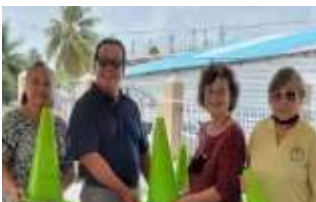
17 th Council Donation of Traffic Cones to Saipan Mayor RB Camacho