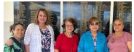
17 th Council with Rotary Club Executives