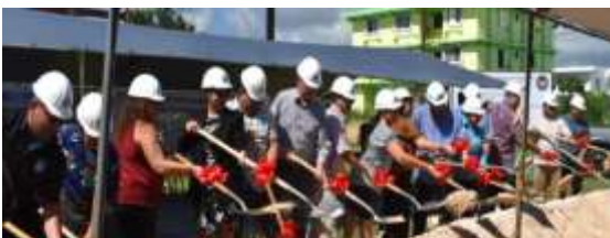
Ground breaking of new Council building next to the USPO in CK