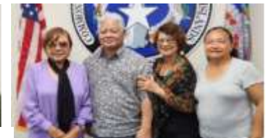
Council courtesy visit with Gov. Palacios