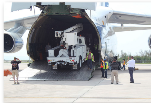
Emergency power restoration efforts during Super Typhoon Yutu.

Permanent work includes recovery activities to restore public facilities and certain eligible private non-profit entities back to pre-disaster condition or to more resilient facilities through hazard mitigation actions that reduce or eliminate long-term risk to people and property.