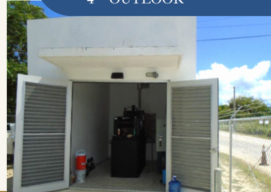
CUC Water System Mitigation Project, Site 11- San Vicente Generator Installation & Generator House Construction