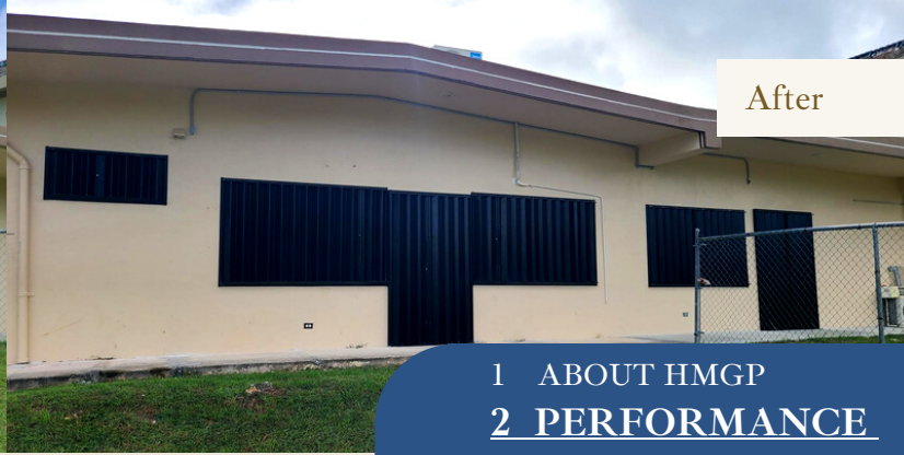
DCCA DYS Tanapag Center Shutter Project