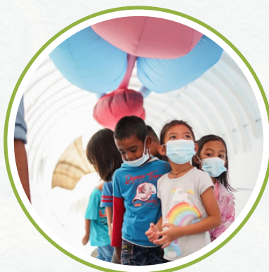
Tinian Elementary Students engaged with Project Based Learning