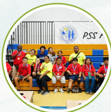
Student Support Services Disabilities Sports Festival