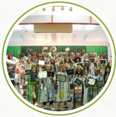
Da'ok Academy 2023 Graduation Ceremony