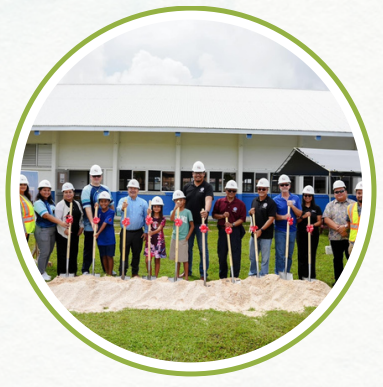
Garapan Elementary School new cafeteria groundbreaking ceremony