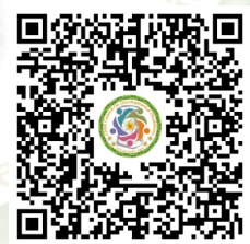
CNMI CDD – Korean