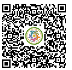
CNMI CDD – Thai