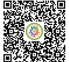
CNMI CDD – Cantonese