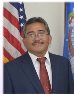
Hon. Efraim M. Atalig MAYOR OF ROTA