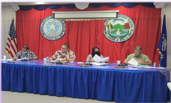
22nd Rota Legislative Delegation