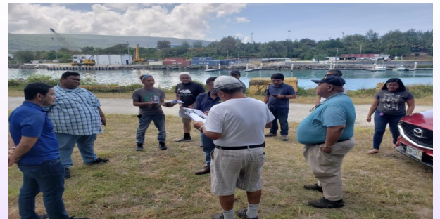
FEMA DR Bid Site Visitation