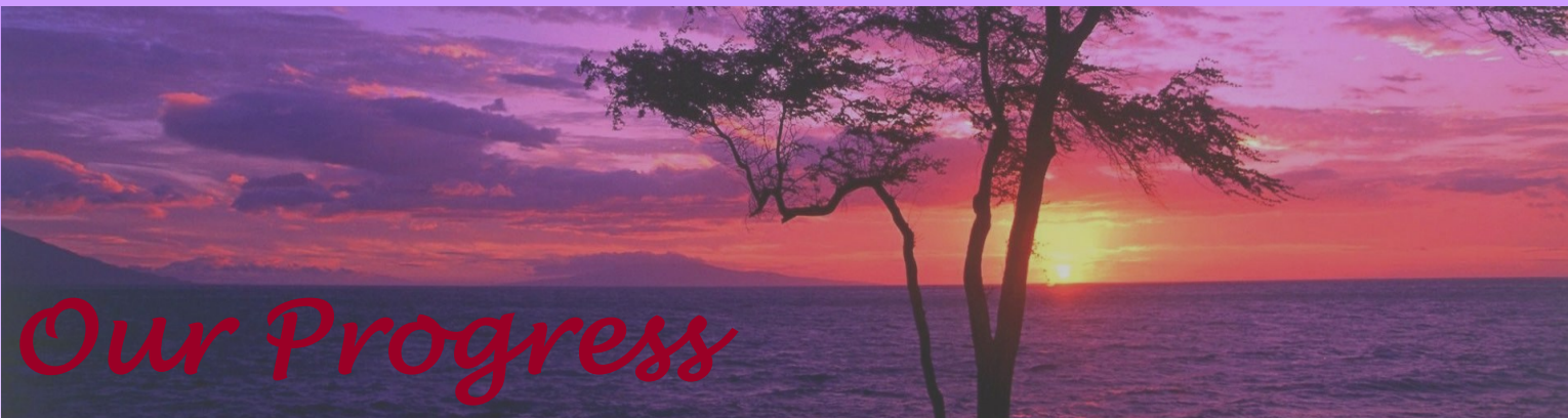
July 21 2022, Guam Liberation Day