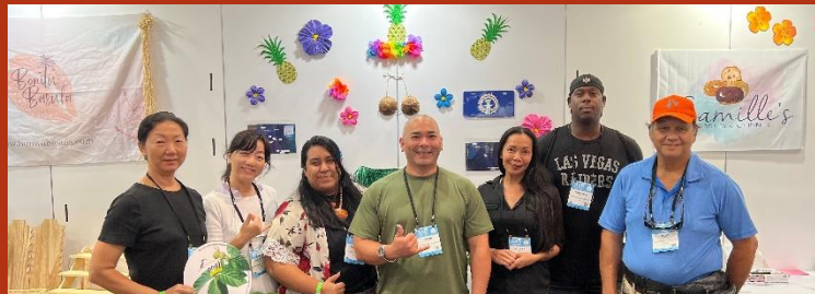
CNMI STEP CLIENTS AT THE AUGUST 2022 AFFORDABLE SHOPPING DESTINATION (ASD) TRADE-SHOW IN THE LAS VEGAS CONVENTION CENTER