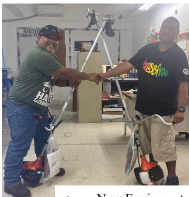
⇒ New Equipment