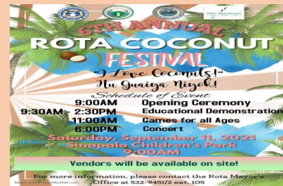
The 6th Annual Coconut Festival kick off September 15, 2021.