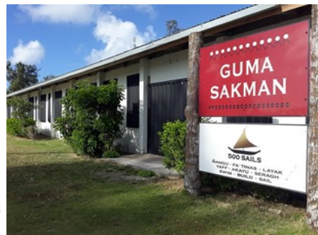
500 Sails Boat Yard , Lower Base