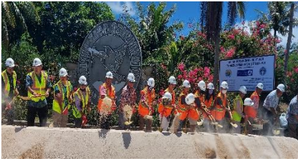
Picture on the left, Route 36 Windward/Chalan Kalabera Road Improvement Project funded by FHWA. Contract amount ($11,983,867.00). Picture on the right, Route 315 (QuarterMaster Road) and Route 33 (Beach Road) Intersection Improvement and Installation of Traffic Signal System. Contract amount ($1,945,638.00) funded by FHWA.