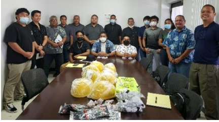
Picture on the Left, Public School System (PSS) Boot Camp Summer Internship Program with DPW to enhance career, educational knowledge and development. OSHA Training provided with Safety Gear. Picture on the right, Route 35 (Tun Herman Pan) Road Improvement Contract amount ($1,097,694.00) Funded by FHWA.