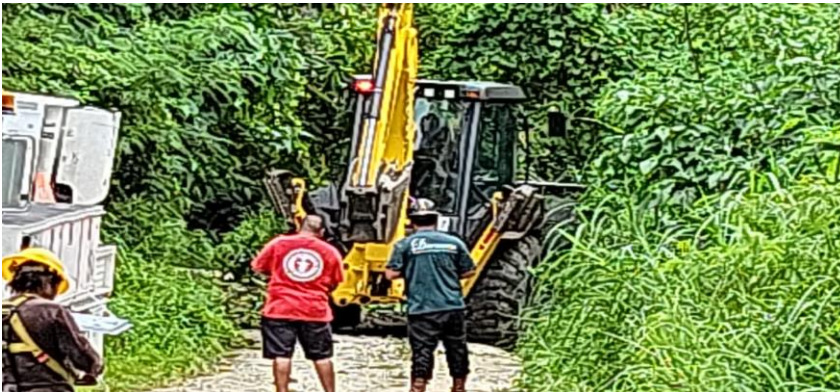
Hazardous Waste Material Clean up at our Lower Base Transfer Station work performed by APEC. Shown are before and after pictures.