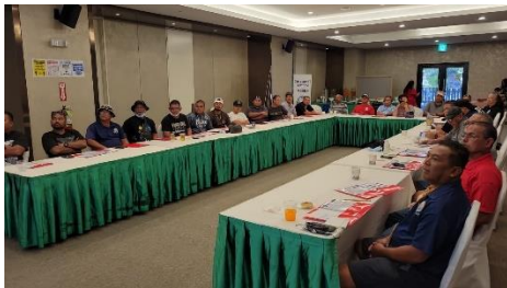
Picture on the left is Disability Training for the Department of Public Works First Responders at Saipan World Resort. Presenters: NMPASI, Assistive Technology Program and University Centers for Excellence in Developmental Disabilities (UCEDD). Picture to the Right and below are DPW RAC Team responding to emergency calls to remove fallen tree blocking road access.