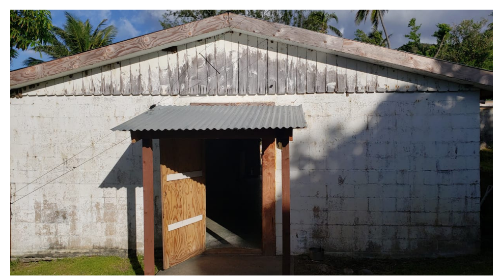
Newly renovated roof for Agrihan dispensry/Mayor's Office.

Citizen-Centric Report (Pursuant to PL-20-83)