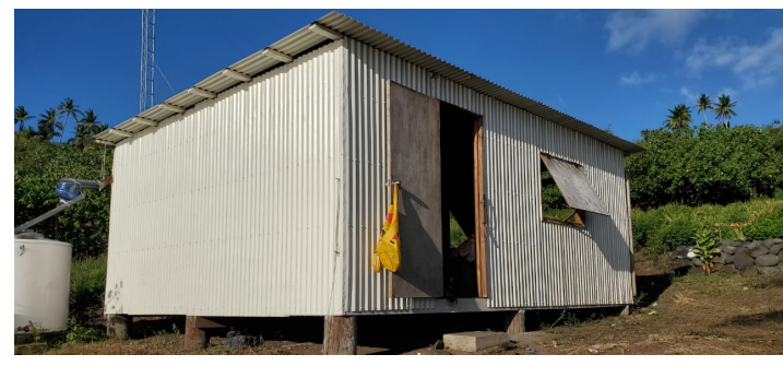
Mayor's Office on Alamagan

The Northern Islands Mayor's Office has completed some major repairs on all three islands. On Agrihan island, the semi-concrete dispensary needed major repair on the roofing and was completed. Pagan and Alamagan needed new typhoon shelters /Mayor's Office to shelter residents and store government equipments in case of typhoons. Also, the three islands needed major repairs and renovations to the old cement tanks for water. These projects were complete and new projects are on-going now on the islands.