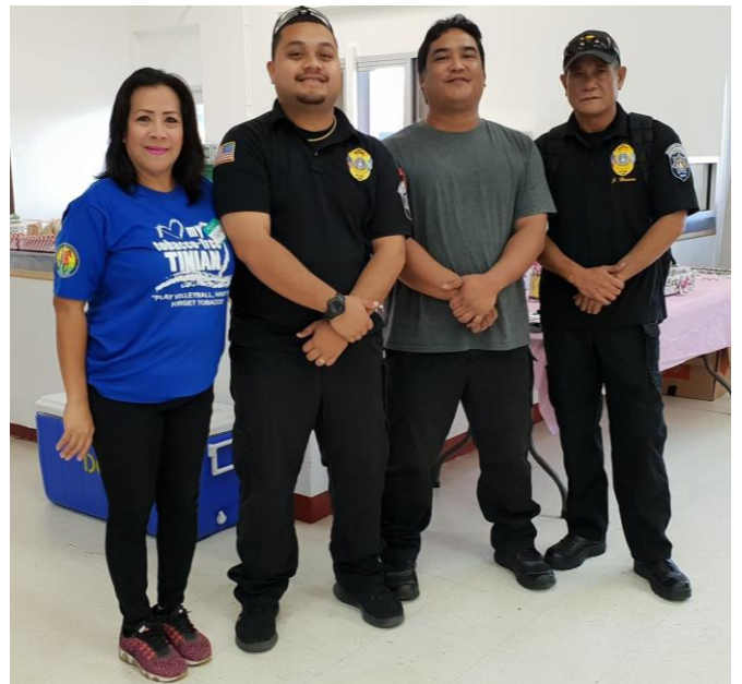
Parent Summit Outreach w/SPN ABTC