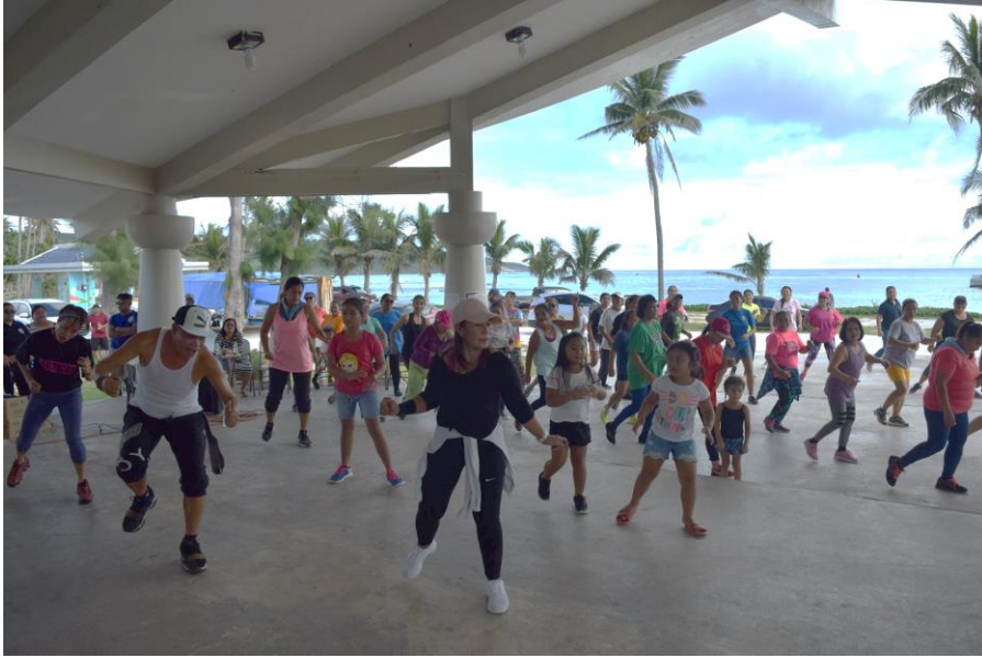
Anti-Tobacco Wellness Program (Zumba w/First Lady Diann)