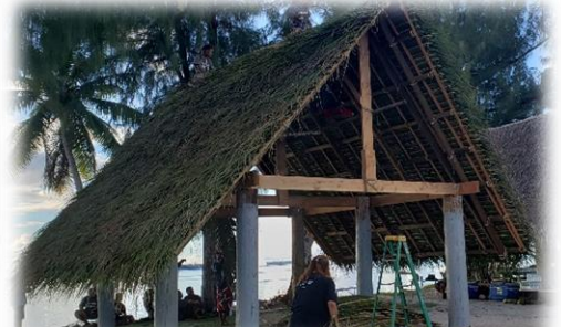
2 nd Chamorro Thach House