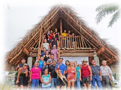
1 st Chamorro Thach House