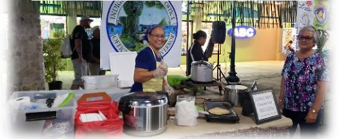
Traditional Chamorro Food

Cultural Expo. Many Chamorro demonstrators were featuring indigenous medicinal practitioners, indigenous food, local fisherman, cultural