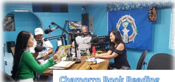
Chamorro Book Reading