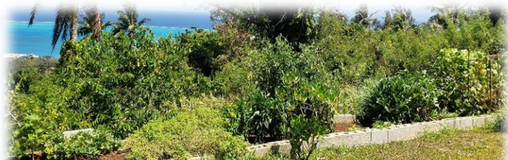
Local Crops and Medicinal Plant Garden