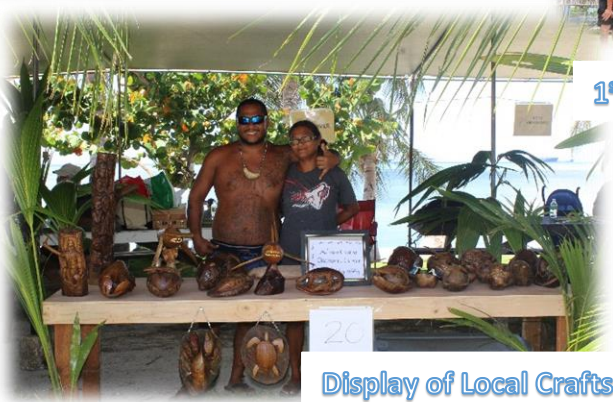
Display of Local Crafts