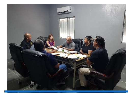
Executive Meeting held at the CNMI Board of Parole Conference Room