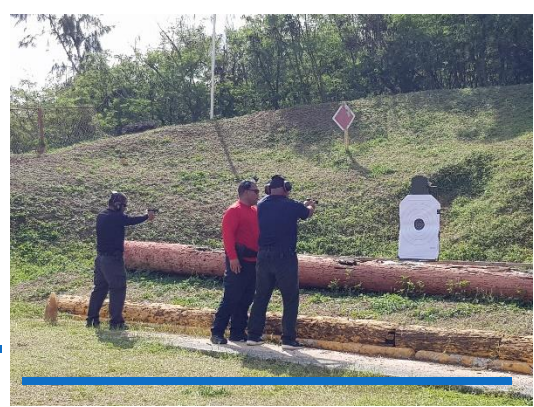
Firearm Recertification at Shooting Range, Marpi