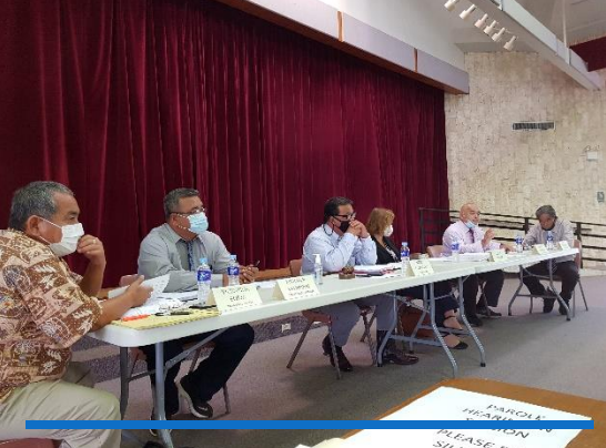
Parole Hearing held at the Hon. Governor Pedro P. Tenorio Multi-Purpose