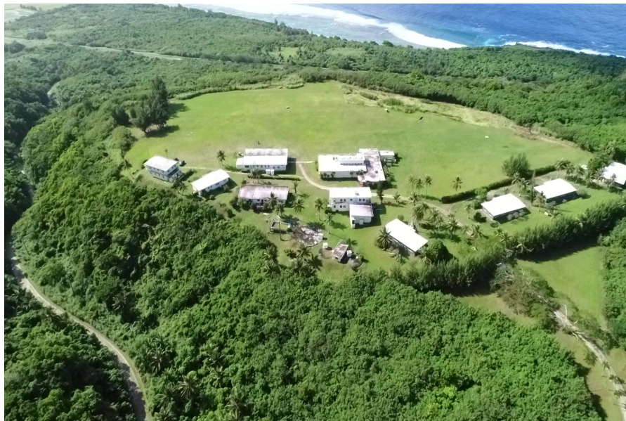
HOPE Recovery Center Marpi, Saipan, Commonwealth of the Northern Mariana Islands