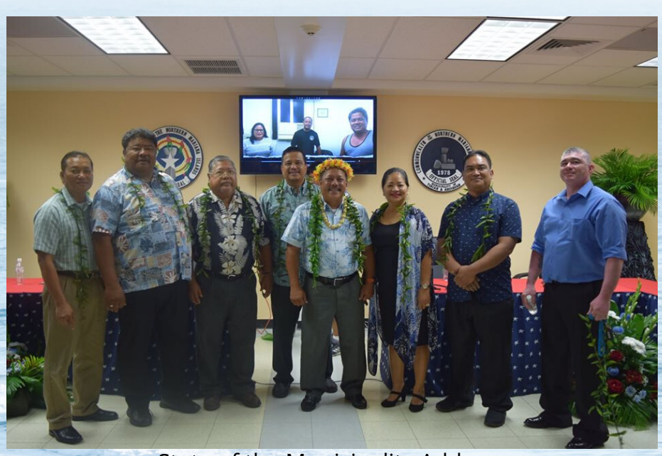
State of the Municipality Address