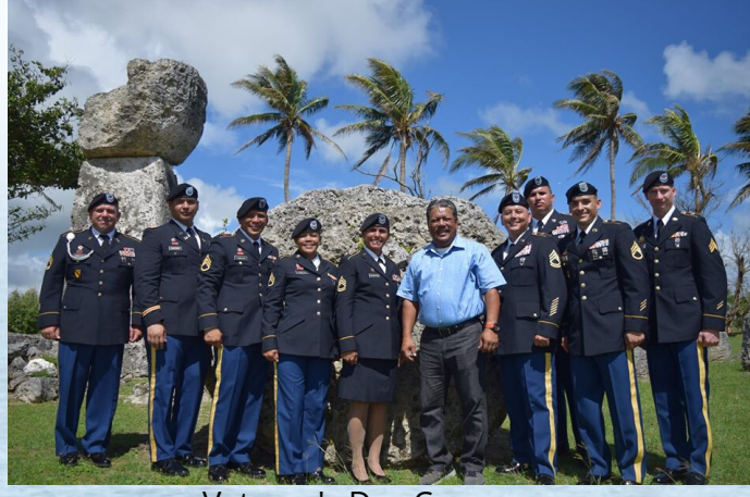
Veteran's Day Ceremony