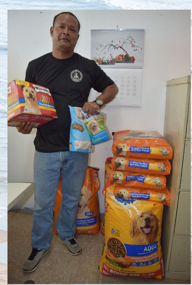
Donation of dog supplies from the Humane Society