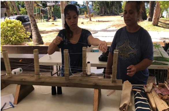
TEPENGI KKOSH REFALUWASCH PROGRAM

Even with our funding issues, the Carolinian Affairs Office continues its effort to seek other avenues to deliver the services, programs and activities for the Carolinian Community. However, it works both ways, improving communications and the dissemination of information on issues affecting community and the support and participation of the Carolinian community. As we increase the number of participation, we strengthen our justification for increase of funding and most especially the continuity of our programs and activities.